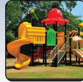
Childrens Play Area