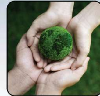
Pollution free zone