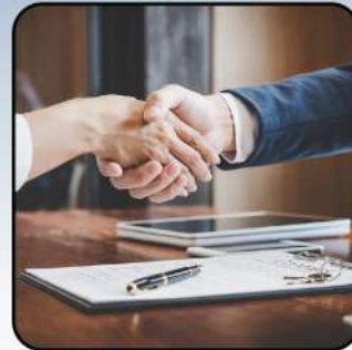
80% Bank Loan