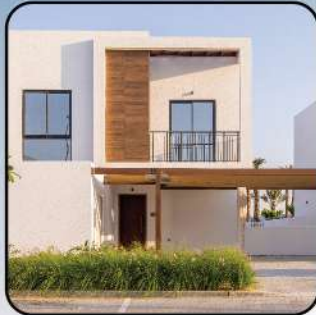
Ready to Build Homes