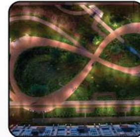
8-walk tracker for senior