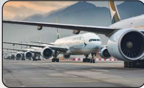
2 Minutes from airport