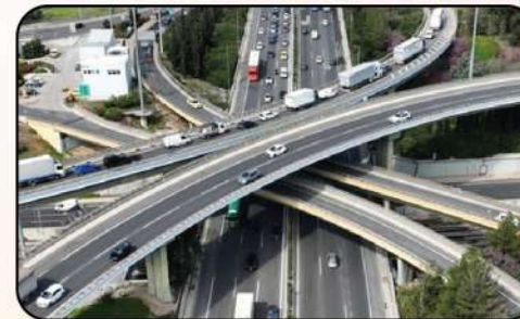
Well-connected roads with transportation