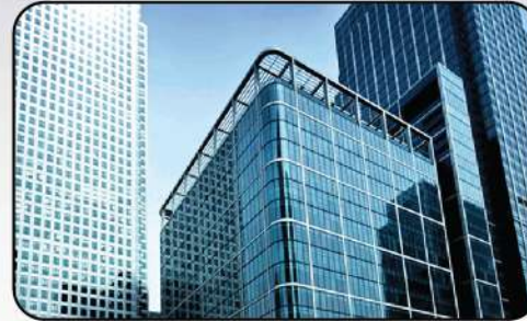
Near IT Hub