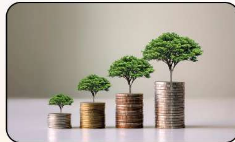
Best Investment Location