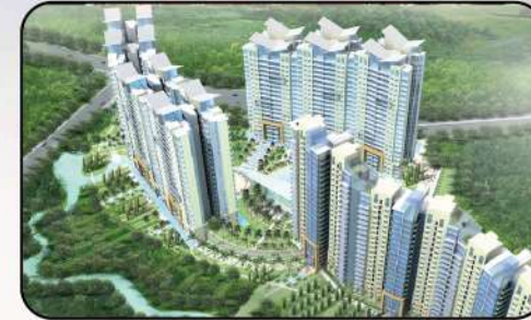
Fast Appreciation Location