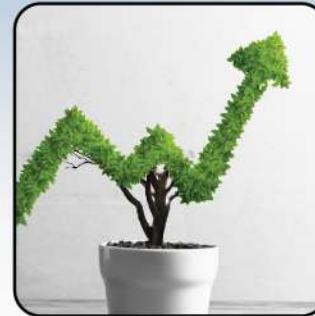
Fast Appreciating location