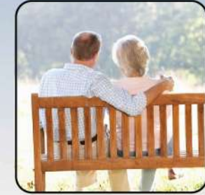
Senior Citizen Corner Park